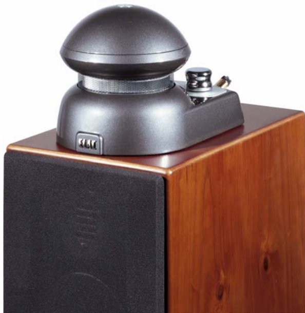
New 4 PI PLUS.2 on bookshelf speaker BS 204.2

The new 4 PI PLUS.2 ribbon super-tweeter is an add-on component that creates a perfect, spacious sound impression when installed on conventional loudspeakers. The parallel connection of this add-on tweeter leads to a homogeneous directional pattern up to the tweeter's highest operating range of an outstanding 53 kHz. The combination of direct-radiating loudspeakers, providing precise location and imaging and the omni-directional 4 PI PLUS.2 ribbon super-tweeter providing an open and airy sound, results in perfect spaciousness not found with any conventional loudspeaker. The 4 PI PLUS.2 can be user adjusted to suite an individual's listening preference, room character and to any loudspeakers' crossover frequency. The 4 PI PLUS.2 add-on super-tweeter is universally applicable. It can be used in all applications from stereo to home cinema. It is effective when used with rear speakers and centre speakers. A new sense of depth and height results in an impressive, "live" sound stage.